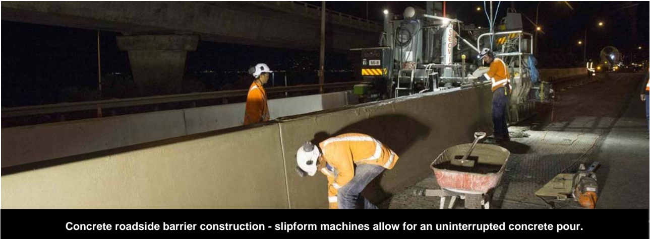
Concrete roadside barrier construction - slipform machines allow for an uninterrupted concrete pour.

NIGHT WORKS – CONSTRUCTION OF CONCRETE ROADSIDE BARRIER SMITH STREET AND SMITH STREET MOTORWAY, PARKWOOD