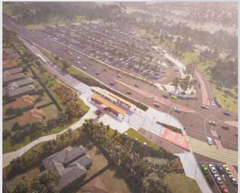
ARTIST IMPRESSIONS OF PARKWOOD STATION

A new intermediate bus stop will be placed along Greenacre Drive opposite the station precinct entrance (eastern side) and the existing bus stop on the western side will be upgraded.