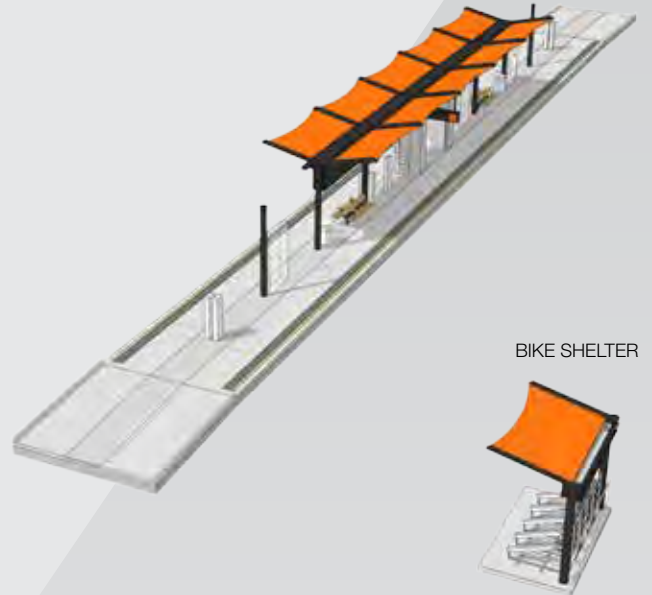
ARTIST IMPRESSIONS OF PARKWOOD EAST STATION